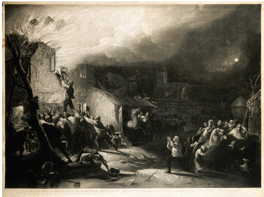
The young boy John Wesley is saved from the burning house.

Through prayer George Müller raised enough money to build and sustain a large orphanage, which is still in operation today.